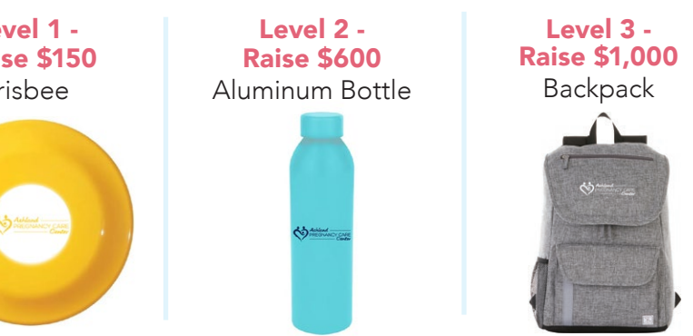
Incentives are for personal fundraising efforts. I-snirts sizes are first-come,