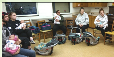
Clients learn about car seat and home safety from a local firefighter.

This year, Ashland Pregnancy Care Center received a generous $10,000 grant from the Samaritan Hospital Foundation to help fund its 12-week parenting class with a strategic focus on the implementation of a healthy lifestyle component including healthy eating and healthy homes. Part of this focus is providing better education and prevention on the opiate crisis and how it directly impacts infants.