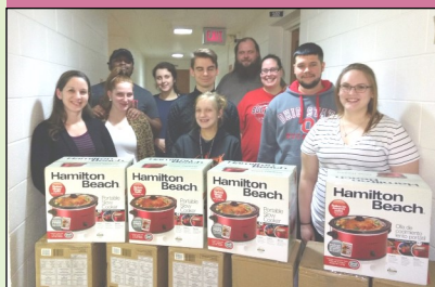
Families earn their incentives after faithfully attending Parenting Class for the first 6 weeks.