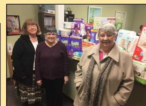
Paradise Hill United Methodist