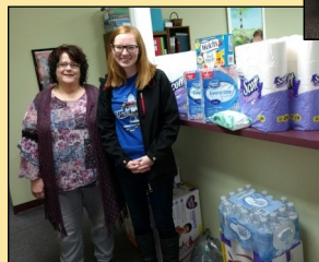
Nursing Christian Fellowship