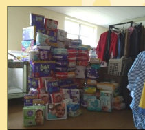
Ashland Dickey Church