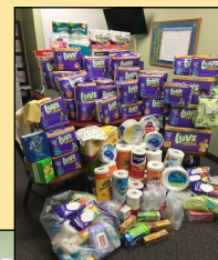
First Christian Church & Ashland Middle School 7th Graders