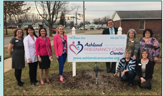
On Tuesday, Feb. 20, 2018, APCC Staff and Board Members met with Lt. Governor Mary Taylor.

front. Ohio Lt. Governor Mary Taylor heard about us and stopped by for a tour and to learn more about our life-saving work.