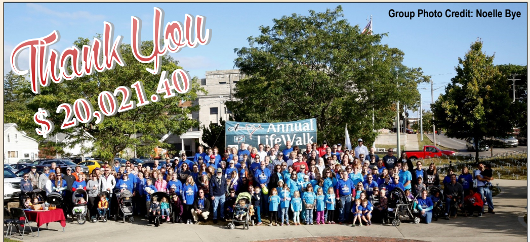
Group Photo Credit: Noelle Bye

THANK YOU FOR HELPING US LET LIFE SHINE!