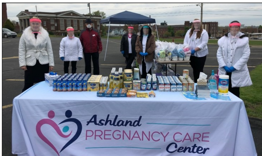
Ashland Pregnancy Care Center blessed moms with essential supplies just before Mother's Day.

Featured in National Publication of PREGNANCY HELP NEWS