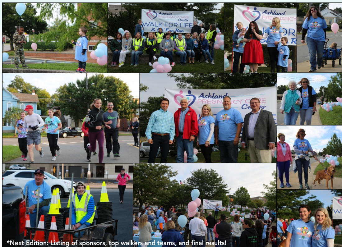
*Next Edition: Listing of sponsors, top walkers and teams, and final results!